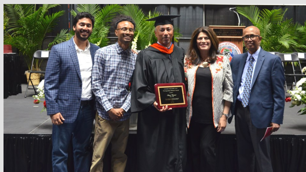
World Class. Every Day.